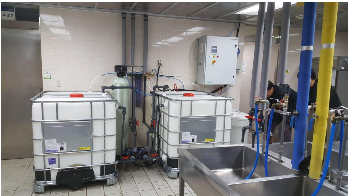
Installation of Lavanda2000