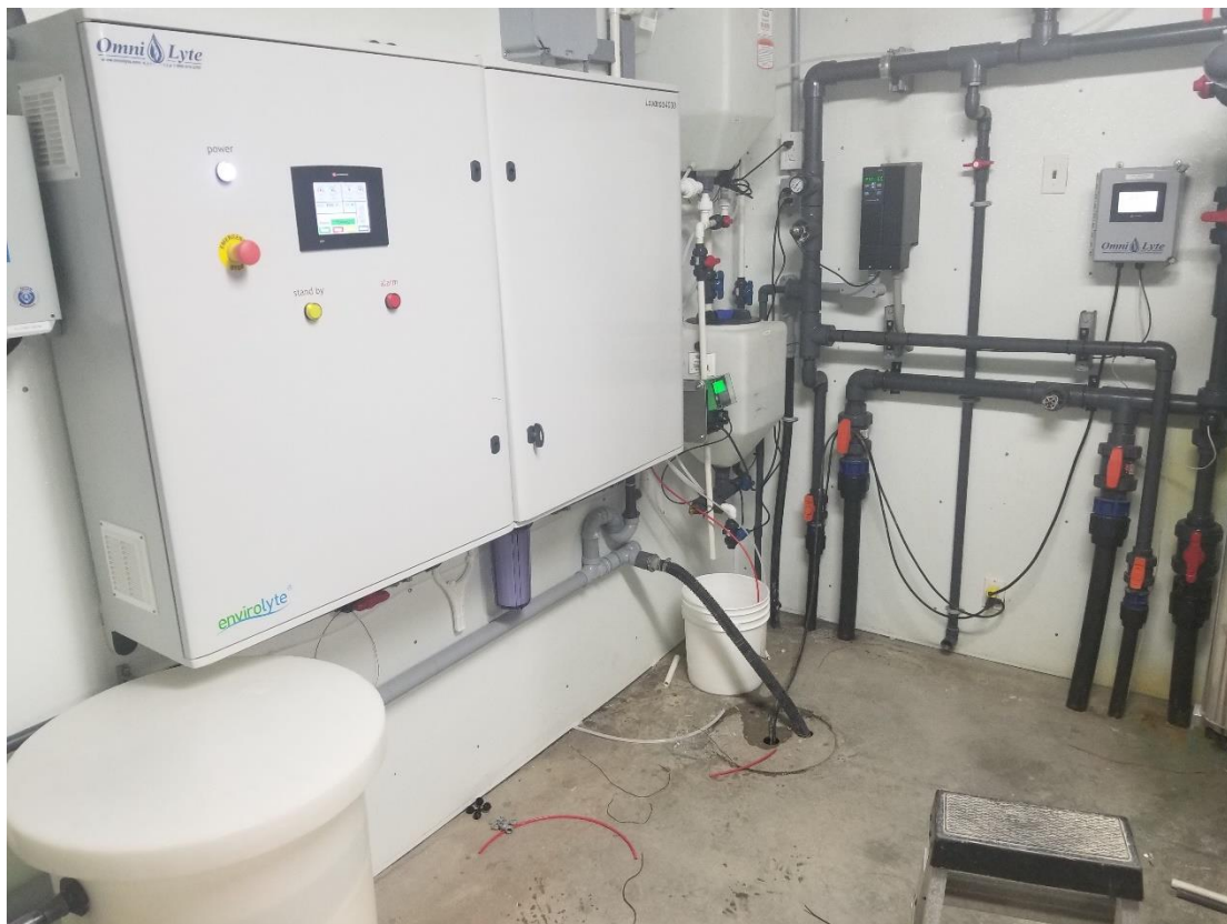
Installation of Lavanda4000